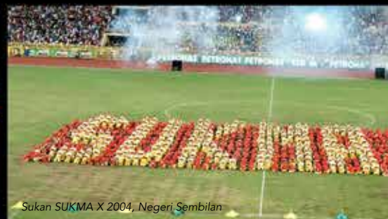
Sukan SUKMA X 2004, Negeri Sembilan