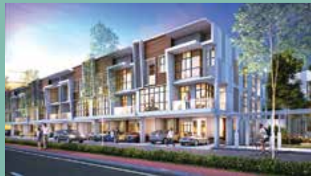
3-storey Waterfront Town Villa - type B Built-up Area : 3,237 sq.ft.