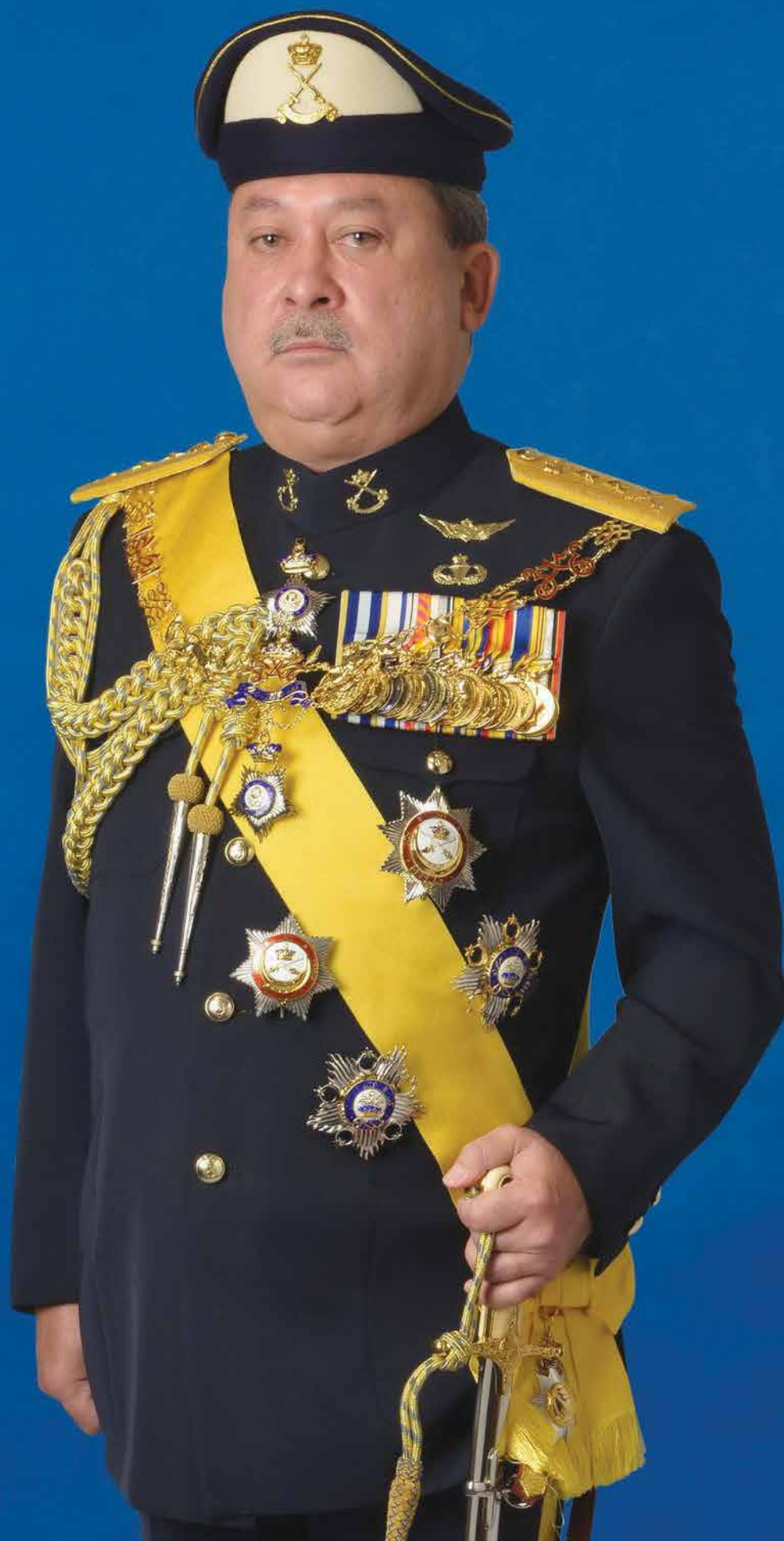
DULI YANG MAHA MULIA SULTAN IBRAHIM IBNI ALMARHUM SULTAN ISKANDAR SULTAN DAN YANG DI PERTUAN BAGI NEGERI DAN JAJAHAN TAKLUK JOHOR DARUL TA'ZIM