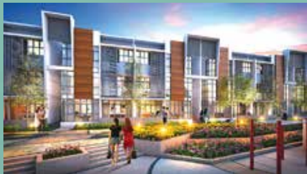
3-storey Waterfront Town Villa - type A Built-up Area : 4,021 sq.ft.

By the river, close to the city is Botanika - an integrated residential masterpiece that features 3 storey town villas that exemplify the finest in waterfront living with magnificent scenic views that inspire and awe. This is your chance to be part of Johor Bahru's most exciting and unique residence.